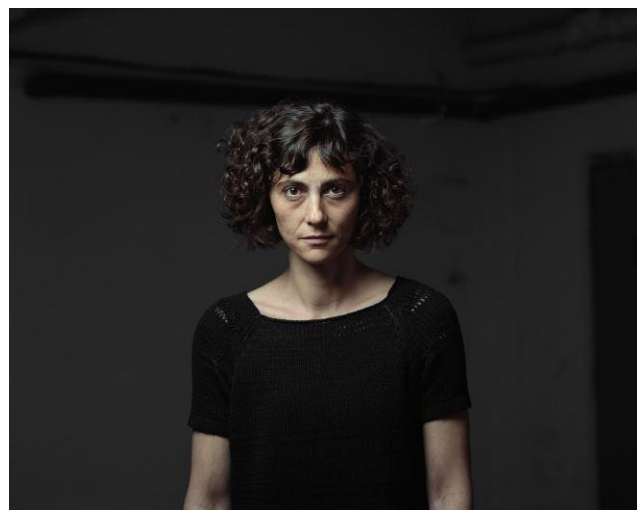
Press image 6 from the series »Psychadascalia«