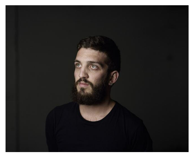
Press image 5 from the series »Psychadascalia«