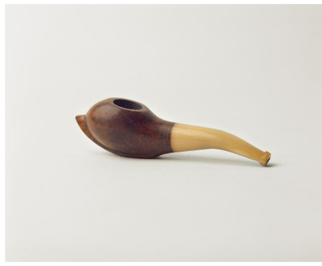
Press image 3 from the series »Objects and Constraints«