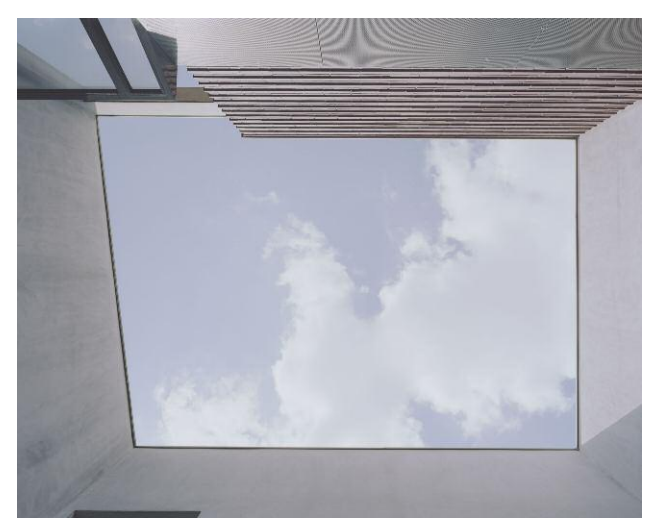
Press image 8 from the series »Bellevue Hospital«