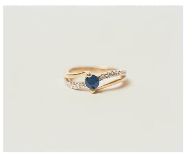
Press image 2 from the series »Objects and Constraints«