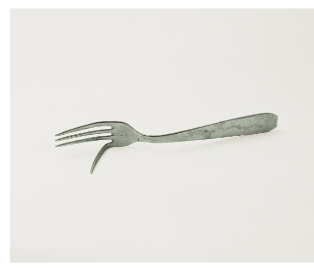
Press image 1 from the series »Objects and Constraints«