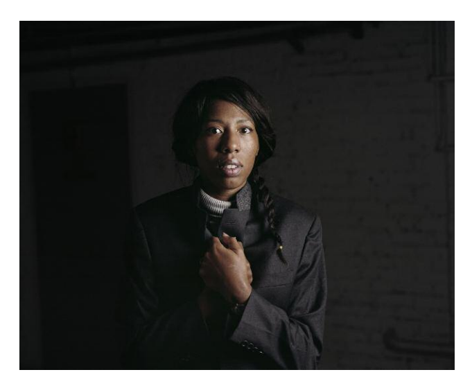
Press image 4 from the series »Psychadascalia«