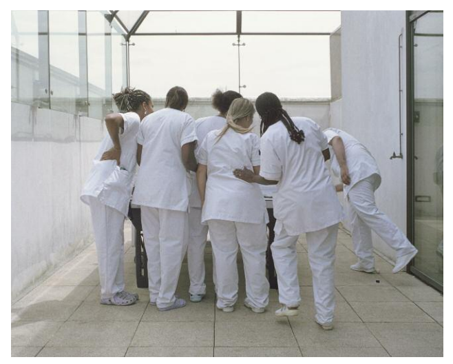
Press image 9 from the series »Bellevue Hospital«